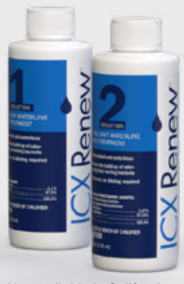
Not available in California.